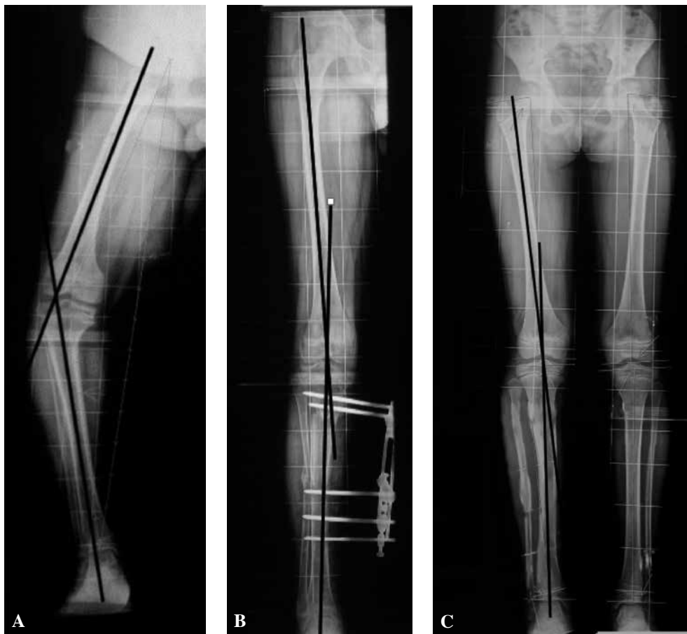
Fig. 5. — A : Preoperative full leg length scanogram of a nine years old female with a right sided juvenile onset Blount's disease showing varus (anatomic Tibiofemoral angle (aTF) was -35^{\circ} ). B : Postoperative scanogram showing 5^{\circ} overcorrection (aTF angle became 10^{\circ} ). C : End of follow up scanogram showing no recurrence.

On the other hand, in cases with a high grade Langenskiöld stage (stage V, VI), a consensus exists that a single procedure is generally not enough and either adjunctive growth modulation procedures or medial tibial plateau elevation are required (4,20,31,50,57). Lastly, cases with overgrowth of the proximal fibula in relation to the tibia, unipolar lengthening of the tibia in relation to the fibula is needed to level the proximal tibio-fibular joint (5). So, in the three above conditions either gradual correction or multiple procedures are required.