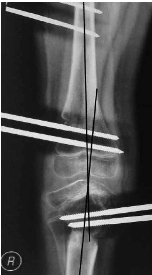
Fig. 4. — X-ray near full consolidation of a juvenile female child 9 years old in which synchronous distal femoral and proximal tibial correction were carried out. It shows 10° valgus (5° overcorrection).

and it occurred in four out of 30 legs (13%). Three of them were classified as Langenskiöld stage III and showed minimal recurrence (-5°). The fourth case was Langenskiöld stage IV and showed significant recurrence (-10°). These cases were counselled for regular close follow up for a possibility of the need of another interference. No significant LLD (> 1.5 cm) was recorded at the end of the follow up.