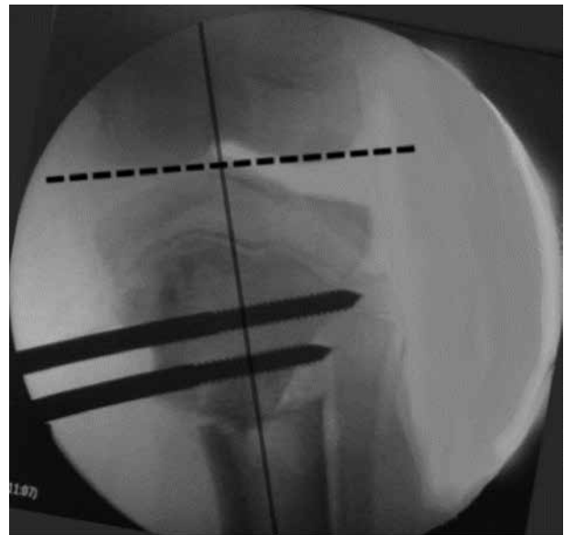
Fig. 2. — Intra-operative C-arm view after achieving the required correction demonstrating (1) The metaphyseal Schanz screws are parallel to the proximal knee joint orientation line and distal to the proximal tibial epiphyseal plate. (2) The mechanical axis highlighted by the shadow of the electrocautery cable passes through the centre of the knee. (3) lateral translation of the distal bone end on the proximal one.

using a Rancho cube as a guide. A percutaneous straight cut corticotomy was then done through a 2-3 cm anterior incision just distal to both the tibial tuberosity and the distal pin using multiple drill holes with a 4.5 mm drill pit. Prophylactic percutaneous anterior compartment fasciotomy was performed using a long blunt-nose scissor through the same corticotomy incision. Acute correction was performed in this sequence : derotation, translation, angulation , and lastly extension if procurvatum was present. Derotation was done until the second toe of the plantigrade foot aligned with the patella. As a rule of thumb, for each degree of angular correction, 1% lateral translation of the distal bone end on the proximal one at the osteotomy site was done and monitored under the C-arm (Fig. 2). After obtaining the required angular correction, the resultant increase in the surrounding soft tissue tension would aid the bone ends to jam and lock at the osteotomy site. Now, this corrected position was firmly halted by the assistant. The pre-assembled construct was then fixed to the previously inserted proximal two Schanz screws in the metaphyseal area. Consequently, the distal segment was fixed to the construct by similar two Schanz Screws. The mechanical axis alignment was then checked under the C-arm using the electrocautery cable stretched between the centers of the hip and the