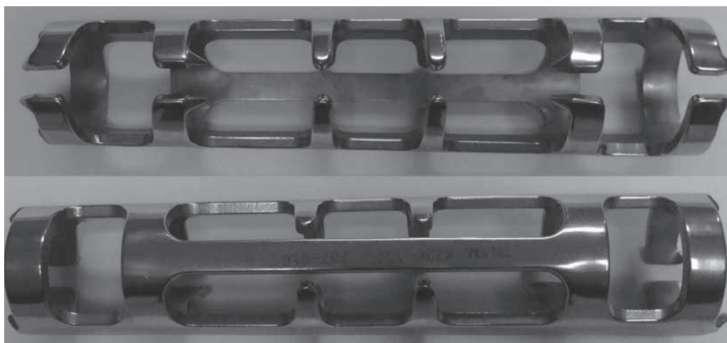
Fig. 1. — Photograph showing the shape memory embracing fixator

Shape memory alloys (SMA) constitute a group of metallic materials with the ability to recover a previously defined length or a shape when subjected to an appropriate thermomechanical load. In 1975, Andreasen made the first implant of a superelastic orthodontic device. Subsequently, various shape memory devices were developed and applied clinically in the cardiovascular and orthopedic fields (8,22).