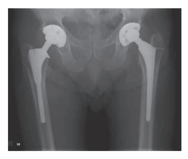
Fig. 3. — Bilateral total hip arthroplasties with the JRI Furlong fully HA coated prosthesis (Right side) and the proximally coated Omnifit prosthesis (Left side), uncemented acetabular components have been used bilaterally.