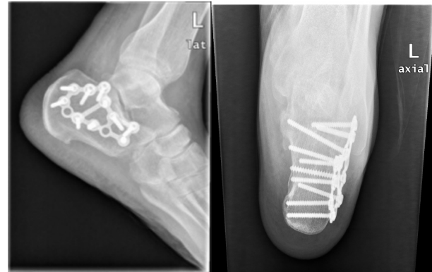
Fig. 5. — The axis was satisfactory and internal fixation was in position 15 months after surgery