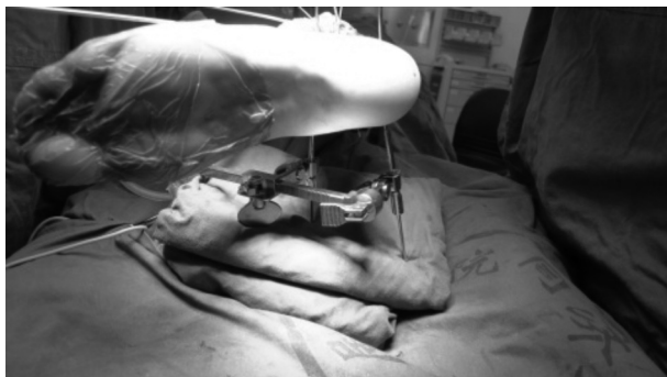
Fig. 4. — Intra-operative distraction

The mean duration of surgery was 80.4 minutes (range, 69 - 101 minutes) and mean hospital stay was 16.1 days (range, 6 - 24 days) in non-MDT group. The 112 patients from non-MDT group were followed up for 20.1 months in average (ranged from 15 to 36 months). All of the cases healed well, and the mean time of bone union was 11.1 weeks (range, 8 - 18 weeks). Complications were observed in 4 patients with painful fixation and 6 patients with delayed healing of incisions. The mean AOFAS score was 85.2 at 1 year after surgery. Typical case is shown in picture 6.