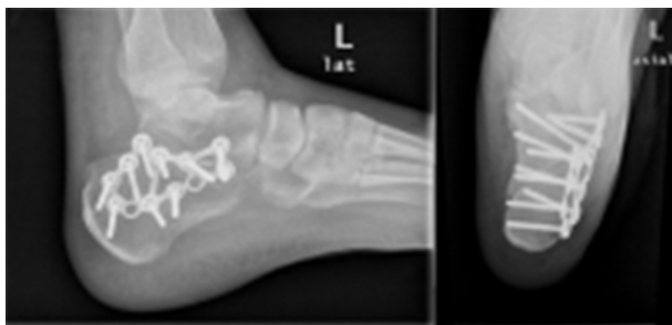
Fig. 3. — Postoperative X-ray showed reduction of articular surface and correction of varus and shortening deformity

1 year after surgery with excellent and good rate of 80.8% . A typical case is shown in figure 2.