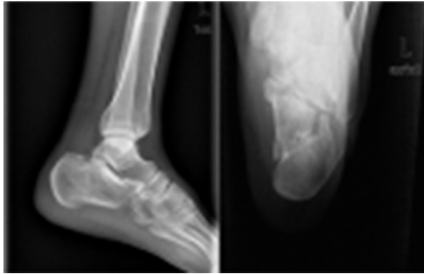
Fig. 2. - Displaced fracture with varus and shortening deformity preoperatively