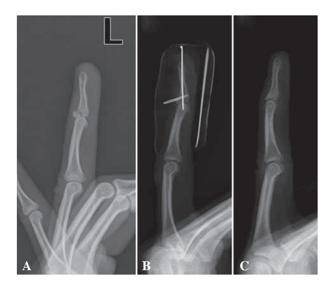
Fig. I. - A 33-year-old male with a mallet fracture of the left ring finger.

(A) Preoperative X-ray of the type IB mallet fracture. (B) The X-ray 1 week after surgery shows well-maintained reduction without displacement. (C) The X-ray 2 months after surgery shows complete bony consolidation.