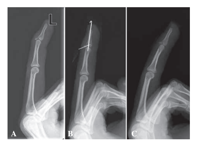
Fig. 2. — A 25 year-old-male with a mallet fracture of the left middle finger.

The follow-up period ranged from 2 to 12 months. Complications and bony union were evaluated by a clini-