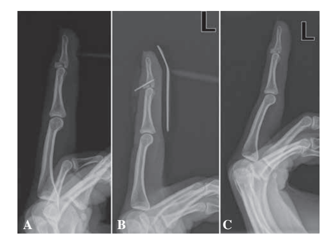
Fig. 5. — An 18-year-old female with a mallet fracture of the left ring finger.

However, one-point fixation of a fracture fragment using a needle does not provide sufficient strength under DIP joint motion (Fig. 5). Therefore,