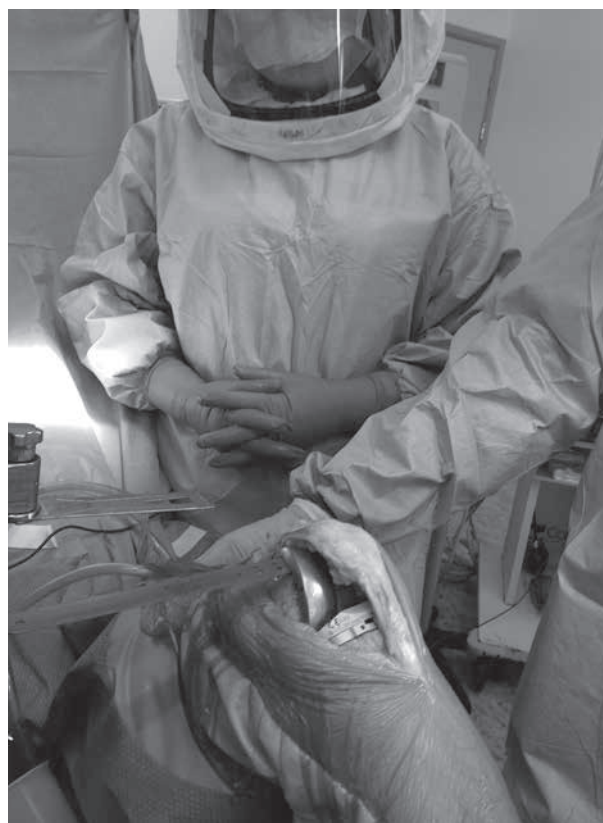
Fig. 1. — Patellar thickness has been marked with diathermy and the ruler is placed on the anterior chamfer cut. The saw is lined up parallel to the ruler in order for the resection plane to be parallel to that of the trochlea.

The superficial and deep tissues, including the capsule, are then infiltrated with a mixture of normal saline, ropivacaine, adrenaline and ketorolac, as