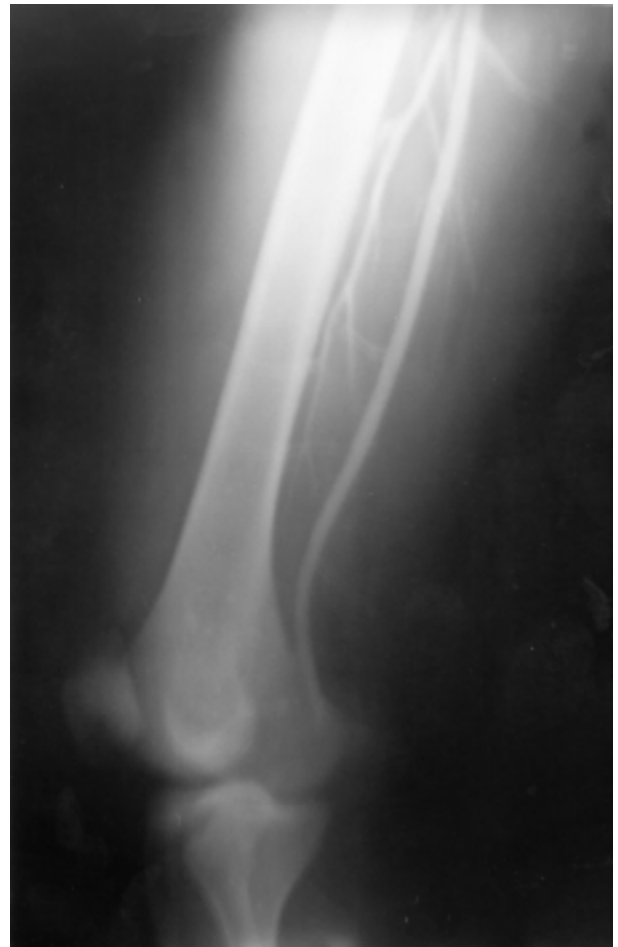
Fig. 2. — Popliteal artery injury after a knee dislocation (xray after closed reduction).