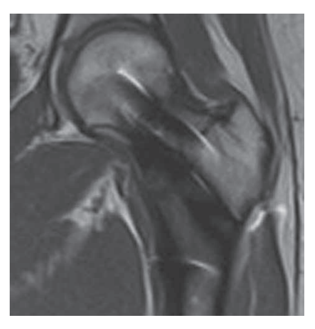
Fig. 2. — Two-year post-operative MRI scan (T-2 weighted, coronal view, left hip) with Targon FN Implant in-situ showing no evidence of avascular necrosis and full union.

The device provides several design advantages over the established methods of either multiple parallel screws or a sliding hip screw, which would be beneficial for surgical treatment of stress fractures