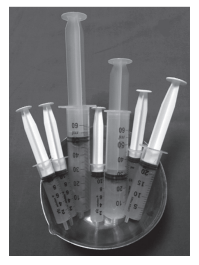
Fig. 3. — Aspirated material from the AC joint cyst

The range of motion, the average value of the pain intensity and the mean Constant score were similar to those recorded before aspiration (Tables I and II). In no case signs of infection or draining