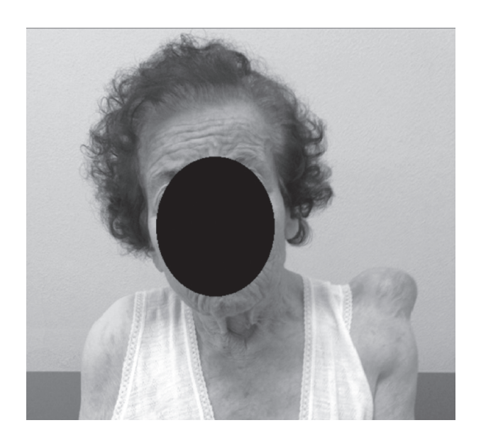
Fig. 1. — A 85 year-old- right-handed woman, with a voluminous acromioclavicular type II cyst on her left shoulder.