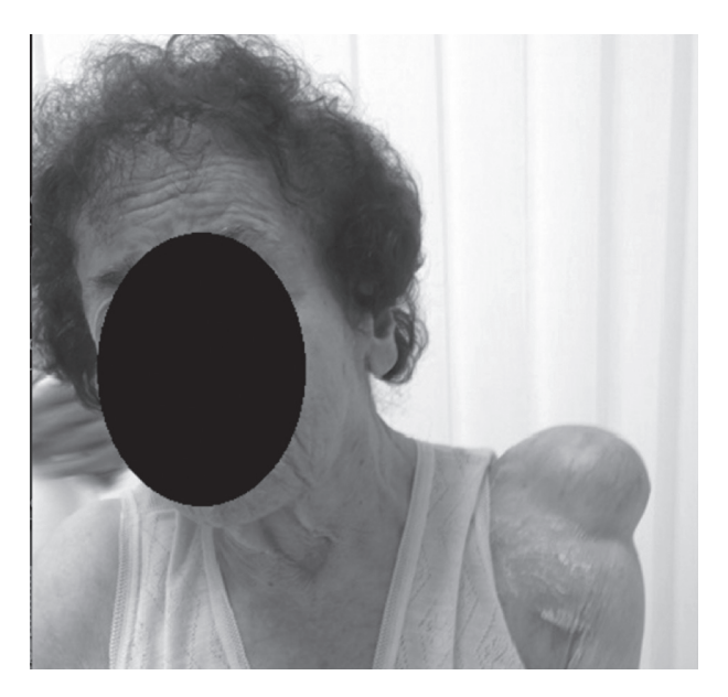
Fig. 4. — Cyst recurrence after 30 days

patients with degenerative changes of the acromioclavicular joint.