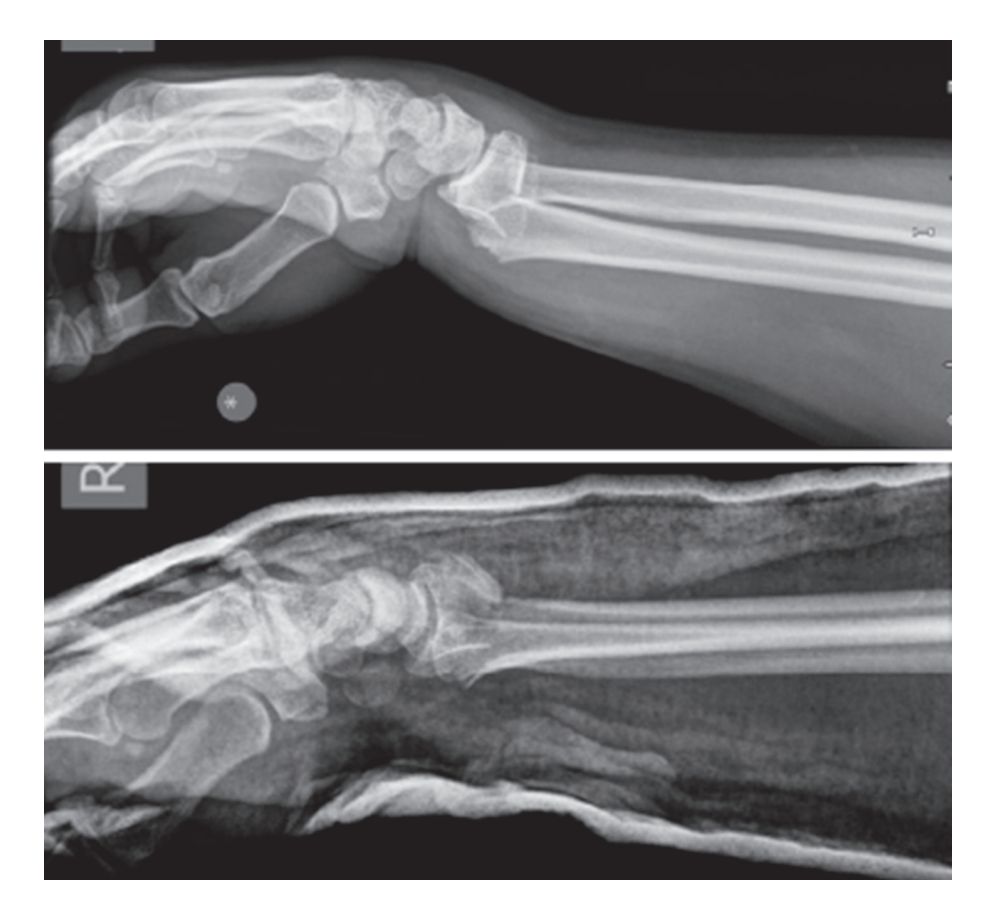
Fig. 1. — An example of failure to reduce the volar cortex