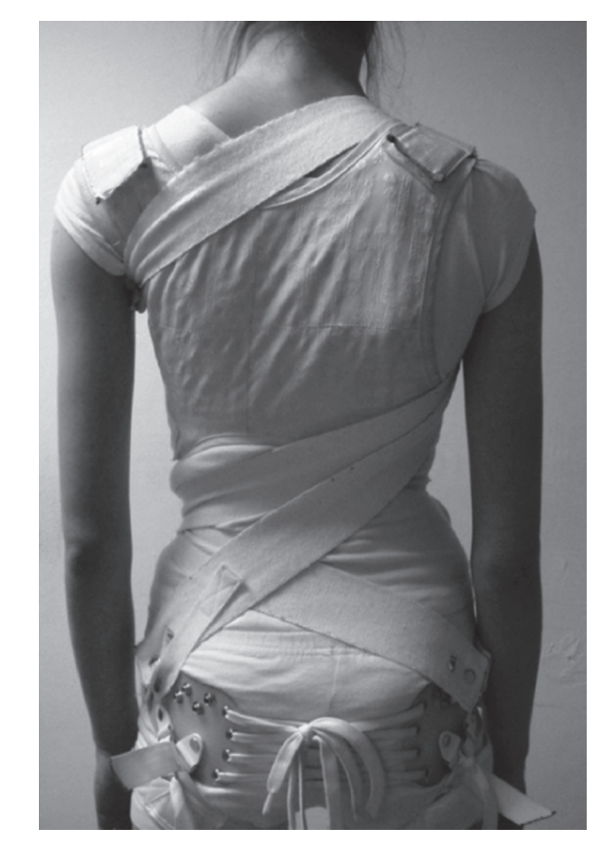
Fig. 1. - SpineCor Brace

Radiological evaluation was done with standing x-rays showing the whole spine. The spinal deformation was measured with the Cobb technique. The Turkish version of the SRS-22 questionnaire, which has proved to be reliable and valid, was used to determine the quality of life of patients. This questionnaire was given to patients after the first year of brace treatment.