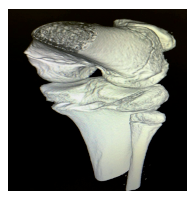
Fig. 1. – 3D CT- SCAN Reconstruction of the knee.

Nine days after surgery he was discharged home without any complication.