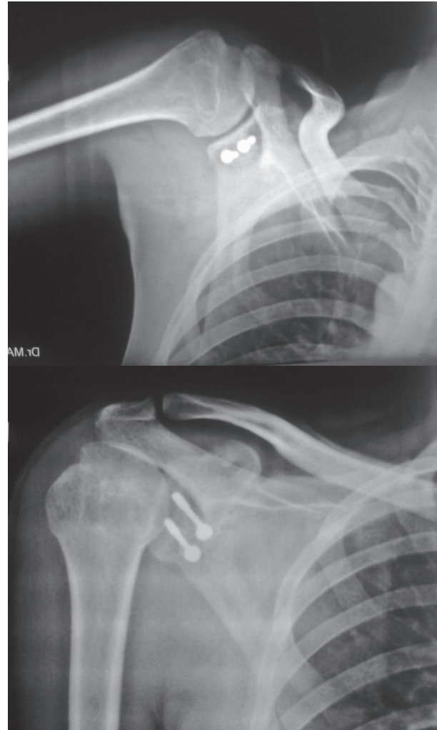
Fig. 3. — Postoperative x ray

Preoperative mean active forward elevation was 169^\circ\pm 6.8^\circ (range, 160 to 180^\circ ) which increased postoperatively to 172^\circ\pm 5.9^\circ (range, 160 to 180^\circ ).