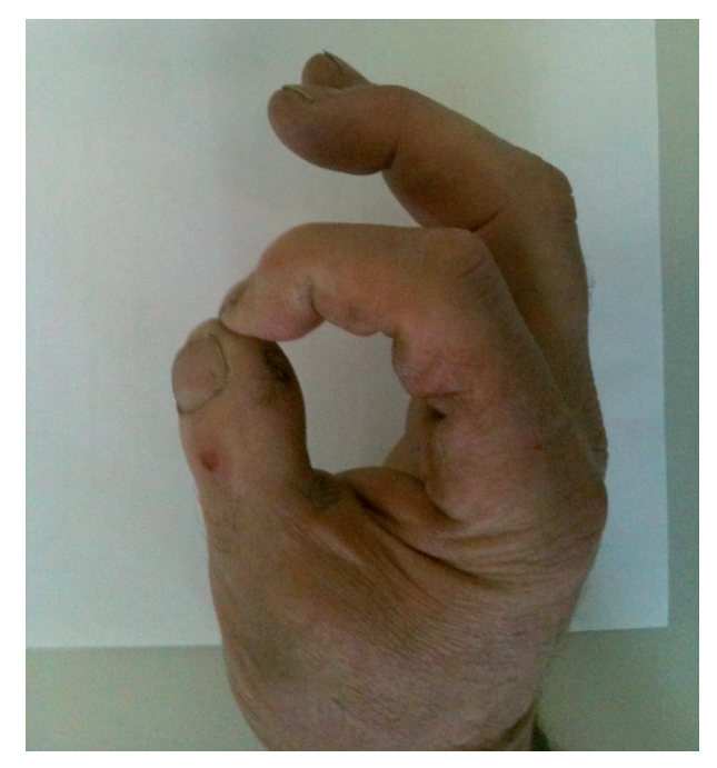
Fig. 3. — full opposition to the index was feasible in all patients who had normal long fingers.

and patient satisfaction with the cosmesis of the hand and foot. The VAS is a subjective scoring method for pain or dissatisfaction from 0 (best value = no pain / very satisfied) to 10 (worst value = the most severe pain ever / very dissatisfied) on a 10-cm scale