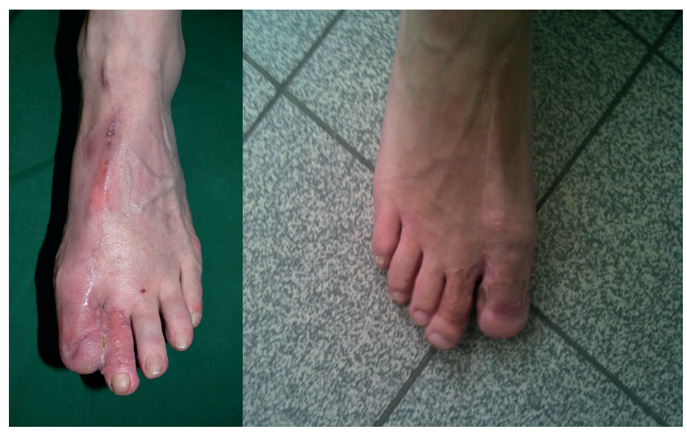
Fig. 2. — cross toe flap from the big toe (a) and after division 3 months post-op (b)