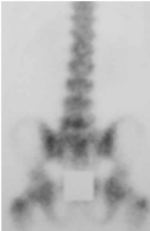
Fig. 2. — Technetium bone scintigram : increased uptake at the level of the left L 5 -S 1 facet joint.

ported (21). The exact incidence of this entity is unknown. In 1981, David-Chaussé reported a single case of SAFJ in a series of 491 spinal infections : an incidence of 0.2% (5). This is less common than the 4% (6 of 140 cases of pyogenic spinal infection) reported by Muffoletto et al in 2001 (15). The paucity of reports and the discrepancy in occurrence may be partly explained by underdiagnosis, resulting from unfamiliarity with the condition (4, 15). Ergan et al think that SAFJ may be more common than is usually believed (9). There is a slight male preponderance among the cases collected from the literature by Muffoletto et al (17 out of 31 patients) (15). Adults are more frequently affected, at an average age of 60 years (6, 8, 9, 15). To our knowledge, only one other paediatric case has been reported : the patient was a 10-year-old boy (13). Our patient is probably the youngest with SAFJ. The lumbar spine is predominantly affected (8, 9, 15). According to Douvrin et al , only 3 cases of cervical SAFJ have been reported in the literature (8). We found only one reported case of thoracic SAFJ (19). Among 16 cases in which the level was specified, Ergan et al found involvement of the L 4 -