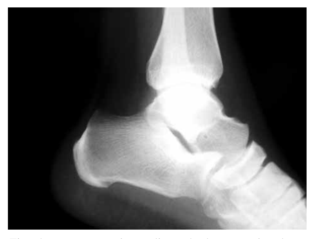
Fig. 1. — Preoperative radiograph demonstrating large calcaneal tuber prominence.

the Achilles tendon insertion, it was augmented using Mitek bone anchors with n° 1 braided Dacron suture to avoid avulsion during the healing period (fig 2). Following surgery, patients were placed in a short leg cast with the ankle placed in 15° plantar flexion. Two weeks following surgery the cast was replaced with a cast in a neutral ankle position. Patients were not permitted to bear weight for the first 4 weeks following surgery. At that time a walking heel was placed on the cast and patients were then permitted to weight bear increasingly over the next two weeks. Six weeks following surgery, patients were placed in a walking boot for a further two weeks. Thereafter patients were encouraged to ambulate as tolerated without the assistance of walking aids. Physical therapy included Gastroc Soleus muscle strengthening and stretching exercises. Patients were evaluated in the office at 6 weeks, 3 and 6 months following surgery.