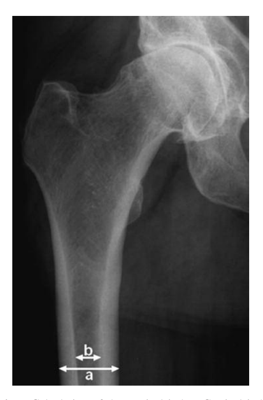
Fig. 4. — Calculation of the cortical index. Cortical index = (10 \times (a-b))/a , where a is the outer diameter of the femur and b is the inner diameter of the medullary cavity 10 cm below the level of the lesser trochanter.

Some studies reported a vertical or horizontal (varus) migration of short stems requiring a subsequent revision (4,23,19), others described significant radiolucent lines or progressive proximal femoral osteolysis around the short stems without a need for revision (9,10). In our study, no horizontal or vertical migration was found at follow-up, not even with the under-sized and varus positioned stem (fig 1).