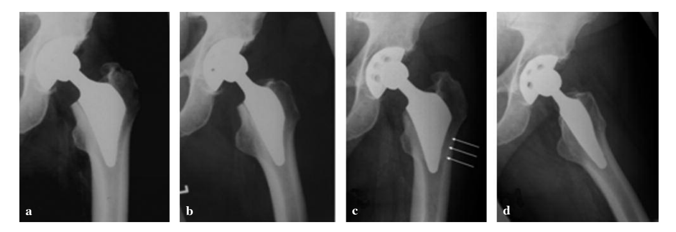
Fig. 3. — Antero-posterior and lateral radiographs of a Proxima stem in a hard cancellous bone (a-b) immediately after operation (c-d) 24 months post op. The stem is fixed by cancellous bone, without loosening.

In previous reports on short stems, the HHS values showed, after a minimum follow-up period of three-months after operation, an increase of 56 points for the Mayo<sup>®</sup> stem (13), 33 for the CUT<sup>®</sup> stem (23); our results showed an increase of 39 points with the Proxima<sup>™</sup> stem. At a minimum follow-up time of 12 months, an increase in the HHS of 51 (4) and 34 points (23) with the CUT<sup>®</sup> stem, 51 with the Proxima<sup>™</sup> (8) and 51 (19) with the Mayo<sup>®</sup> stem have been reported; in this study we noted a 50 points increase in the HHS with the Proxima<sup>™</sup> stem one year post operatively. The increase in the HHS presented in this study appears to be in line with previous reports.