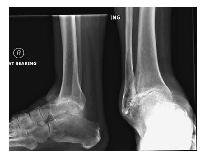
Fig. 3a. — Pre-operative radiographs of a patient showing varus deformity of hind foot secondary to severe osteoarthritis.

Traditionally the most common method for ankle and hind foot fusion was external fixation (10,13). However, firm internal fixation for hind foot arthrodesis reduces the time for immobilisation. This can possibly reduce the time to return to work as well (17). In the past the TTCA with IM nail was used for severe deformity because in addition to fusion the IM nail helps to maintain the correct alignment of the hind foot (Fig. 3a & 3b). It was commonly used as a salvage procedure for cases with failed fusion, AVN of talus and failed TAR (27,40). With new nail types and improvement in the surgical techniques the indications have expanded to include neuropathic conditions, club foot and arthritis of ankle and subtalar joints (16). The major contraindications for IM nail for TTCA are intact subtalar joint, limited bone stock in