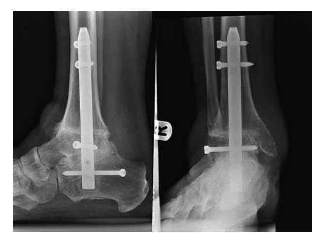
Fig. 3b. — Post-operative radiographs of the patient shown in figure 3a. The patient had tibiotalocalcaneal arthrodesis with intramedullary nail. The figure shows neutral alignment and bony union at 6 months after the surgery.

calcaneum with loss of calcaneal height and severe angular deformity of the distal tibia (16,26,29,43). Presence of active infection in the ankle or subtalar joint is another contraindication (43). However, in this review we have found one study where TTCA with retrograde intramedullary nail was performed for tuberculous arthropathy in the quiescent phase of the disease (18).