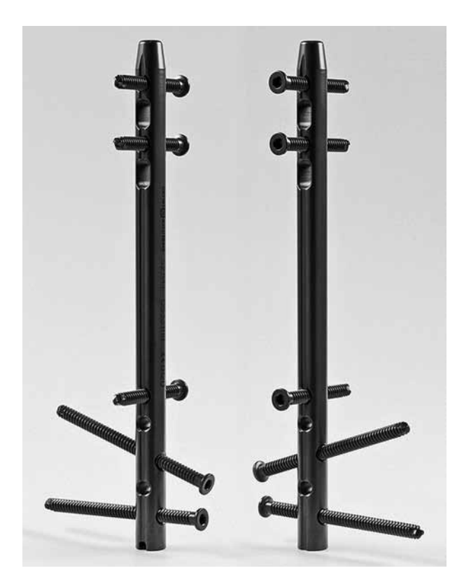
Fig. 1. — Modern Intramedullary nail specially designed for tibiotalocalcaneal arthrodesis with proximal and distal locking screws.(Ortho Solutions, Maldon, Essex, UK).

Although the TTCA with an intramedullary nail was reported more than 50 years ago, there has been a lack of agreement on it is success in terms of union rates and complications, probably because of the variety of indications and heterogeneity among the patients. There is a wide variation in reported complication and re-operation rates as well. As far as we know, so far there has not been a systematic review of the English orthopaedic literature for tibiotalocalcaneal arthrodesis with an IM nail. The purpose of this study was to perform a systematic review of the literature to find out the answers to the following primary questions :