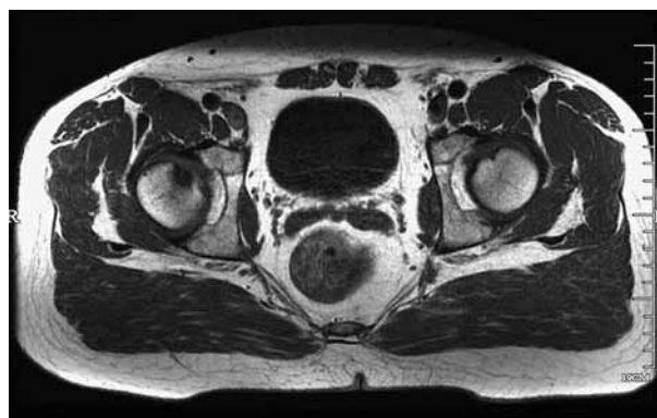
Fig. 1b. — Pre-operative MRI of the pelvis, axial view. Osteochondral lesion of the right femoral head clearly visible as a defect on the articular side.

Decision was made to perform a hip arthroscopy and treat the lesion by means of implantation of a Trufit® bioabsorbable osteochondral matrix plug.