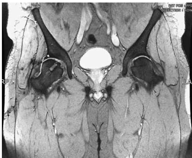
Fig. 2a. — Post-operative MRI at 6 months, coronal view. The Trufit ® Plug is visible in situ .

cyst was filled well by the plug. On the border however, a little spot of different intensity persisted (Fig. 2a & b). It is known to be very difficult to interpret those early MRI images of ingrowth of Trufit plugs (2).