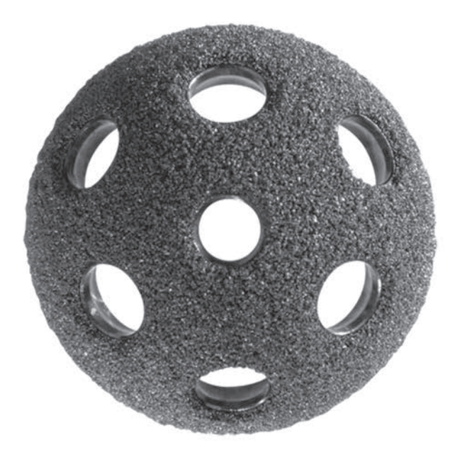
Fig. 1. - Gription Multihole Mega Cup

reamer used). Augmentation of the acetabular bony defects was achieved using cancellous autogenous iliac bone graft. Mincing of the graft was accomplished by reverse reaming, trailed by introduction of the Multi-hole mega Gription (Fig. 1) porous coated cups (Depuy J&J, USA) in the best position ; maintaining the inclination and anteversion angles.