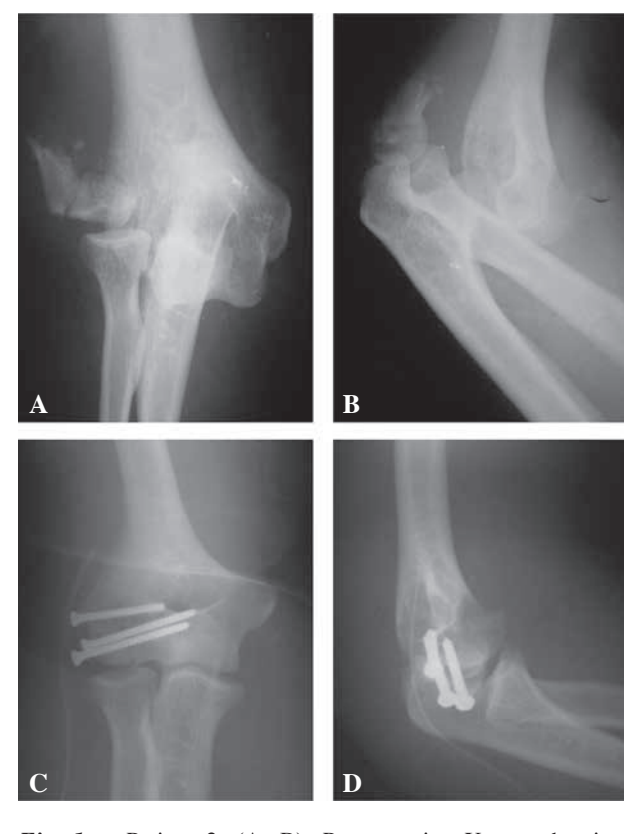
Fig. 1.- Patient 2. (A, B). Pre-operative X-rays showing Fracture-dislocation of the humeral condyles (AO-Type-B1.3/ Postero-lateral elbow dislocation). (C, D) Postoperative radiographs.

This is a single-site retrospective study with prospective clinical review on six fracture-dislocations of the humeral condyles (unicondylar fractures of the distal humerus associated with elbow dislocation) (Fig. 1). There were six men with an average age of 31 years (range 21-43). These lesions were collected in a set of 179 consecutive fractures of the distal humerus in adult patients treated in our department between January 1st, 2000 and December 31, 2008. The inclusion criteria were a recent fracture-dislocation of the humeral condyles, isolated or not, non-pathological, in patients whose age exceeded 15 years and treated surgically at our institution. All patients were invited to return for clinical and radiological assessment. Subjective assessment of outcome was sought ; we asked patients to rate their own results. It was considered satisfactory for the positive responses and unsatisfactory as otherwise. The institutional review board approved the protocol study. Five patients were reviewed at mean follow-up of 52.96 \pm 12.15 months (range 42.23-72.90). One patient was lost to follow-up.