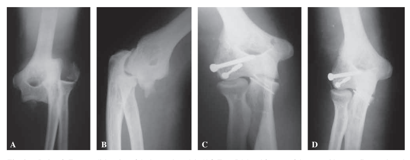
Fig. 4. — Patient 3. Fracture-dislocation of the humeral condyle (AO-Type-B1.1 and fracture of the coronoid process/Postero-lateral elbow dislocation). (A, B). Pre-operative radiographs ; (C). After surgery. (D). Radiographs at 12-month follow- up.