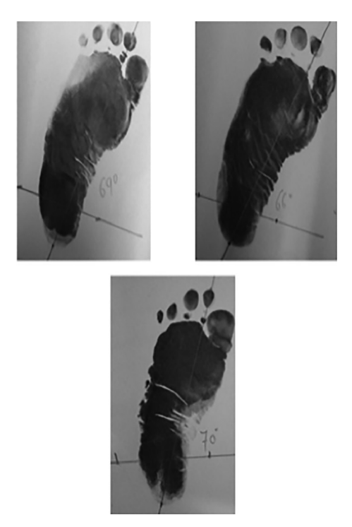
Fig. 2. – Showing calculation of foot bimalleolar angle (FBM) on Podograms