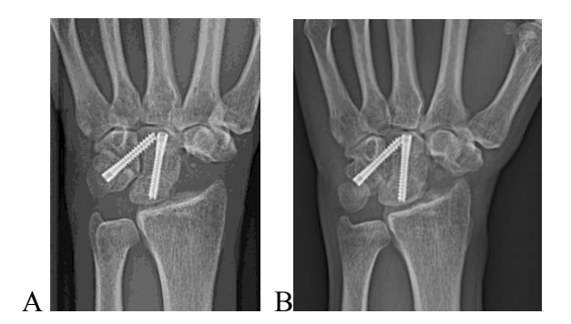
Figure 4. — Painful instability of the pisiform . Plain radiographs one month (A) and six months after surgery (B) show progressive proximal migration of the pisiform relative to the triquetrum.

and seven months after the initial surgery. In the first patient, pisotriquetral pain was caused by intraarticular penetration of the ulnar-sided screw (Figure 3). The second patient postoperatively developed a painful instability of the pisiform with clunking of the pisotriquetral joint during wrist motion (Figure 4). Both patients were symptom free after removal of the pisiform bone. The development of PT joint pathology after scaphoidectomy and 4-corner arthrodesis has been reported anecdotally (3,16,17). First, the cartilage of the PT joint can be damaged by the initial trauma that caused the SNAC or SLAC wrist deformity. A scaphoid fracture or scapholunate ligament tear is typically caused by a fall on the outstretched hand. This typically requires impact on the palm of the hand, including the pisiform bone.