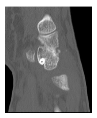
Figure 3. — Pisotriquetral screw penetration. Postoperative development of pain at the pisotriquetral joint. Sagittal computed tomography images show marginal intra-articular penetration of the screw.

Excision of the pisiform bone was performed in three patients. In one patient, the pisiform was excised simultaneously with the 4-corner fusion because of preoperatively symptomatic pisotriquetral arthritis. In the other two patients, a pisiformectomy was performed respectively three