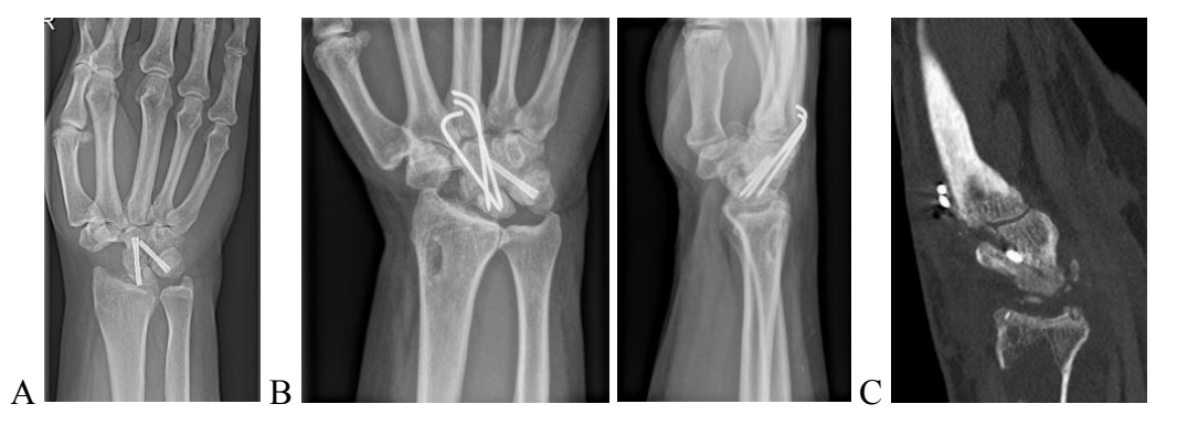
Figure 1. — Nonunion . A. Nonunion between lunate and capitate with screw fracture. B. Revision surgery was performed with removal of the broken screw, interposition of distal radial bone graft and K-wire fixation. C. CT-scan two months after surgery demonstrates successful bone healing.

Scaphoidectomy with 4-corner arthrodesis is a technically demanding procedure. Complication rate depends on the fixation method (13). Secondary operation rate in our study was found to be 19%, far below the one observed by Williams et al. with different fixation techniques (34,4%) (14).