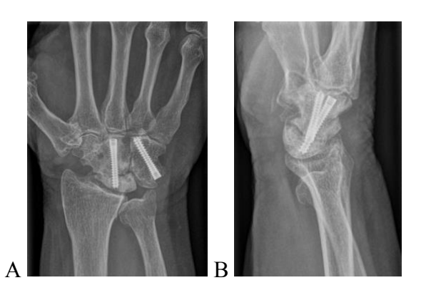
Figure 2. — Avascular necrosis of the lunate. Nonunion between lunate and capitate with radiographic signs of avascular necrosis of the lunate (bone sclerosis, interosseous cysts). A. AP view B. Lateral view.

radiographic outcome was obtained. The second patient had nonunion of the capitolunate articulation combined with avascular necrosis of the lunate (Figure 2). This was associated with a pain score of 3 in rest and 5 during activity. The patient did not find this debilitating enough to warrant secondary surgery.