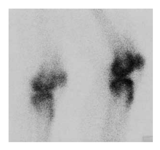
Fig. 1. —99mTc-MDP-bone scintigraphy : diffuse decreased tracer uptake at the right knee.

Standard xrays showed diffuse osteoporosis of the right knee, while 99mTc-MDP bone scintigraphy showed diffuse decreased tracer uptake in the affected leg (fig. 1). A 99mTc-HSA vascular scintigram (1, 5, 6) revealed hypoperfusion in the right