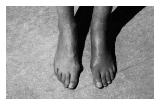
Fig. 4. — Erythrocyanosis of the left ankle and foot

use analgesics again in large amounts. Clinical examination of the right knee again showed a 50^{\circ} flexion and 10^{\circ} extension deficit.