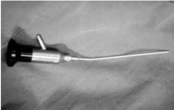
Fig. 2. — Sometimes a scope comes back that way