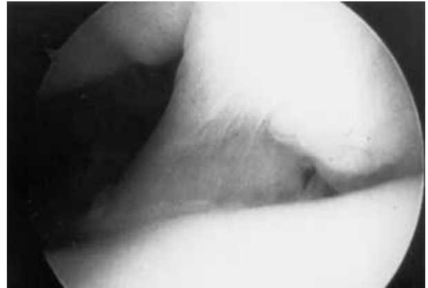
Fig. 3. — Bi-compartmentalization of the wrist

since we had 2 infections after such a procedure, we do not recommend this technique.