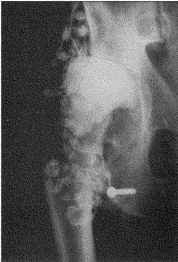
Fig. 2. — 68-year old woman with rheumatoid arthritis and hip joint infection ( S. aureus ). The delay of diagnosis was four months. After resection-arthroplasty and implantation of a bone cement spacer with gentamycin beads the infection was controlled. She had moderate pain and could walk with two crutches.

The final outcome was analyzed in two treatment groups that were related to the radiological stage of joint destruction at first presentation. Group I was classified grade 1-3 with some loss of the width of the joint space and periarticular osteopenia. Group II were classified grade 4-5 with severe erosions and joint destruction (15) (Fig. 2). The restriction of the total