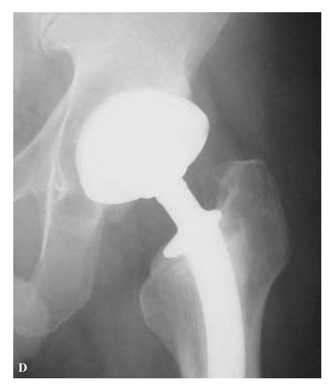
No radiological signs of wear were detected using conventional measurement methods in the two groups of hips. All stems showed stable fixation at follow-up. Quality of femoral cement mantle assessed in the postoperative radiographs was rated good in all hips (8 hips grade A and 2 hips grade B). Two hips presented small voids in the cement mantle underneath the tip of the stem (zirconia