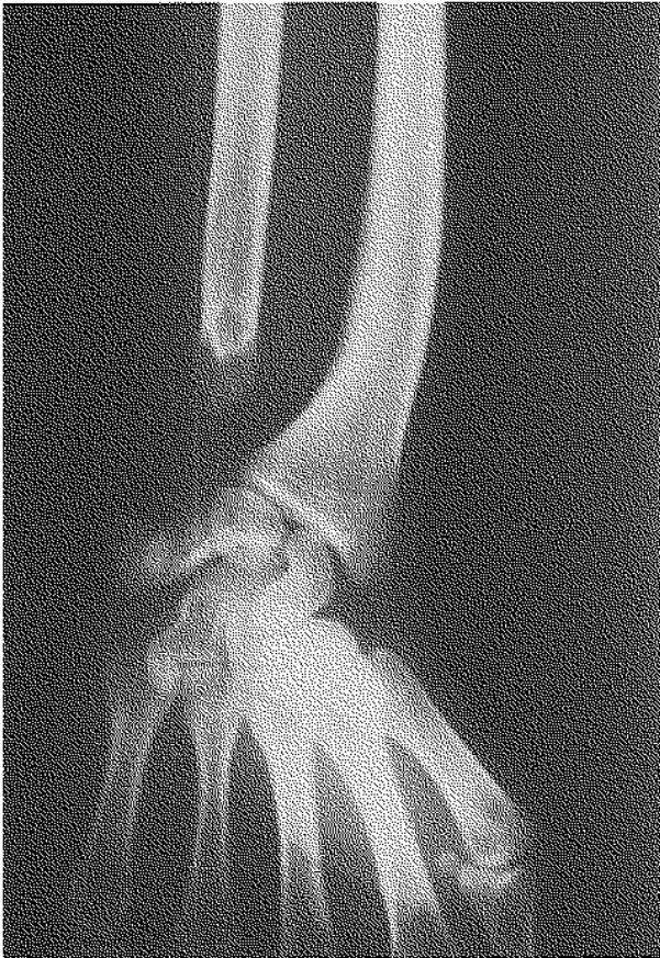
Fig. 1. — Established deformity.

at the site of maximum bowing of the radial diaphysis ; it was internally fixed using an AO-ASIF plate. At the level of the distal radio-ulnar joint, a stabilization procedure was carried out by arthrodesis of the joint, following the Sauvé-Kapandji technique (5). Surgical treatment was followed by immediate pain relief, improvement of the mobility arc, with full pronation and 10° of deficit in supination, as well as the resumption of the patient's regular activities. One year later, xrays showed that fusion of the distal radioulnar joint was not achieved (fig. 2) ; the deformity was however corrected to a large extent and the useful arc was painless and very acceptable to the patient.