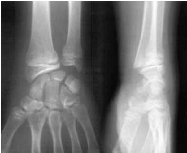
Fig. 1. — Salter type II distal radial fracture associated with a midscaphoid transverse fracture (case 1).