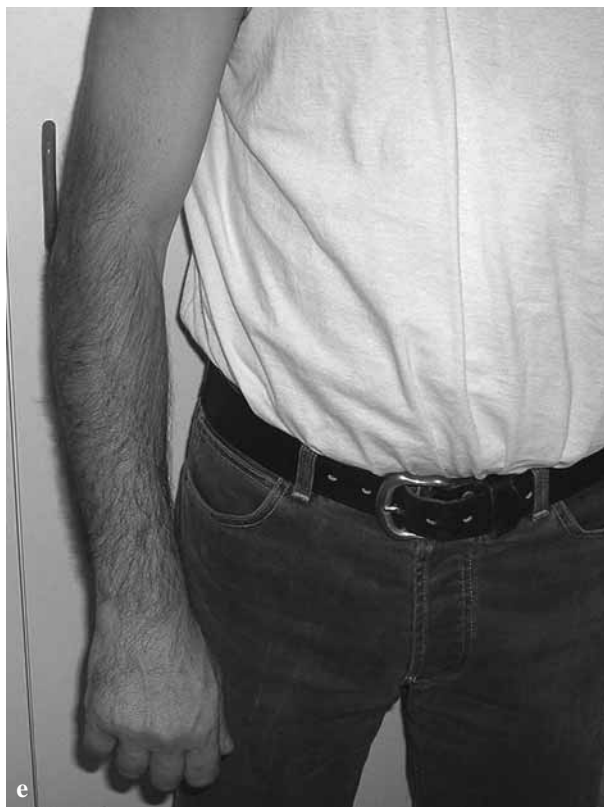
Fig. 2. — a) Radiograph of a 34-year-old man with unstable elbow joint after posterolateral closed dislocation : Preoperative view ; b) The same patient with the fixation device on the 5 th postoperative day : Active flexion position ; c) The same patient : Active extension position on the 5 th postoperative day ; d) The same patient three years after the treatment - Active flexion position ; e) The same patient three years after the treatment - Active extension position.