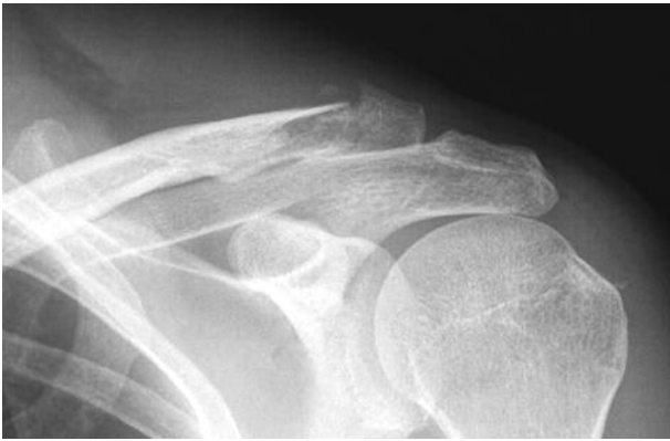
Fig. 1. — Fracture of distal clavicle (classified as Neer type II)