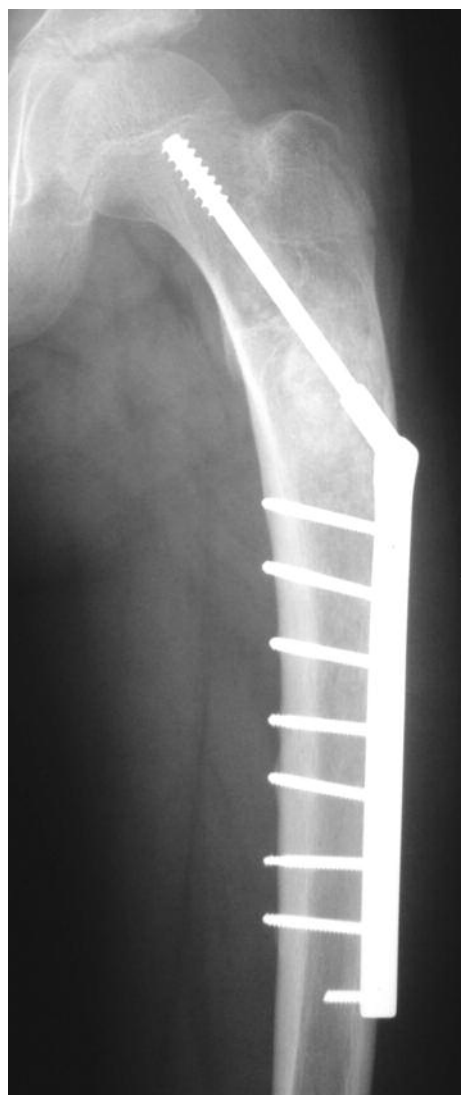
Fig. 2. — Radiograph 3 months after surgery

er, homogenous cellular yields and subsequently higher healing rate. So far, no studies using concentrated bone marrow have been published. However, the results of repeated injections appear more optimistic. The comparative study by Cho et al showed a 23.3% success rate after a first steroid injection and 52% after a first bone marrow injection. With the second injection the healing rates rose to 63.3% and 80% respectively. The authors achieved final success rates of 86.7% with an average of 2.19 steroid injections, and 92% with 1.57 bone marrow injections (10). A recent study by Thavrani et al showed the effectiveness of apatitic calcium phosphate (alpha-BSM) in healing of recurrent simple bone cysts. Most of their 13 patients had a previous history of pathologic fracture and unsuccessful surgical treatment. Despite the fact that only five cysts