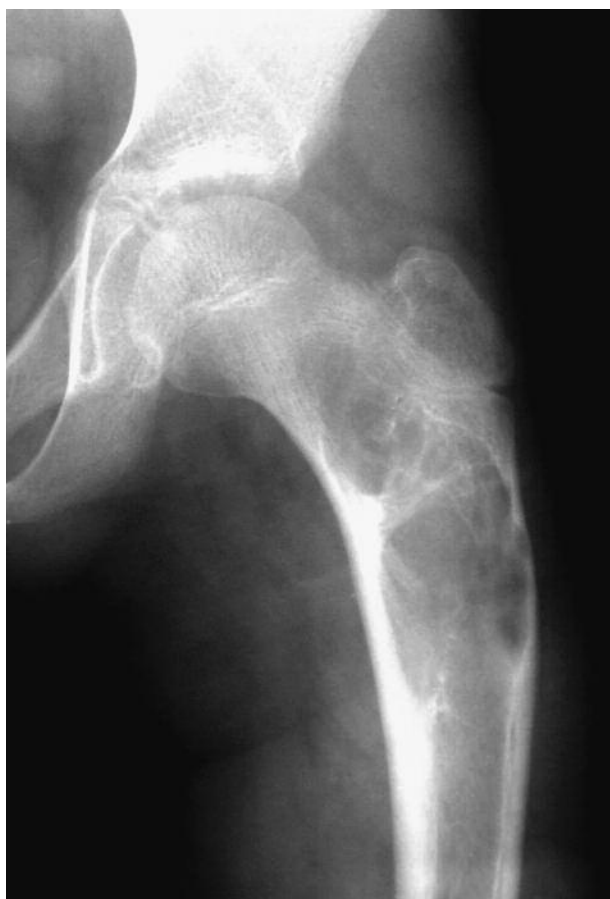
Fig. 1. — A solitary bone cyst of the proximal part of the left femur in a 13-year-old boy.

er, homogenous cellular yields and subsequently higher healing rate. So far, no studies using concentrated bone marrow have been published. However, the results of repeated injections appear more optimistic. The comparative study by Cho et al showed a 23.3% success rate after a first steroid injection and 52% after a first bone marrow injection. With the second injection the healing rates rose to 63.3% and 80% respectively. The authors achieved final success rates of 86.7% with an average of 2.19 steroid injections, and 92% with 1.57 bone marrow injections (10). A recent study by Thavrani et al showed the effectiveness of apatitic calcium phosphate (alpha-BSM) in healing of recurrent simple bone cysts. Most of their 13 patients had a previous history of pathologic fracture and unsuccessful surgical treatment. Despite the fact that only five cysts