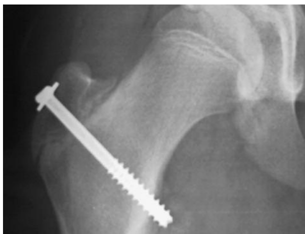
Fig. 3. — Plain radiograph of the hip 6 weeks after surgery

epiphysis (1,2,5,7), in obese male teenagers. We cannot therefore exclude an inherent weakness in the growth plate of the greater trochanter, although our patient presented no risk factors for slipped capital femoral epiphysis.