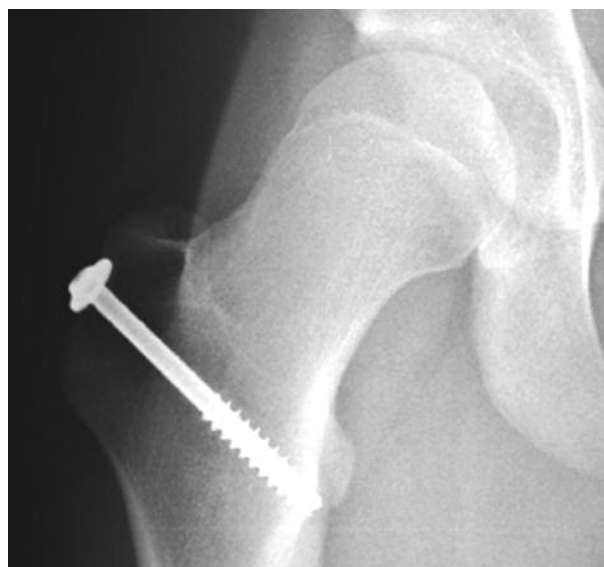
Fig. 4. — Radiograph 18 months after refixation of the greater trochanter shows fusion of the trochanteric physis.

It is important to differentiate a real avulsion fracture, which is very rare, from a widening of the physis of the greater trochanter which may be a radiological sign of osteomyelitis in children (9).