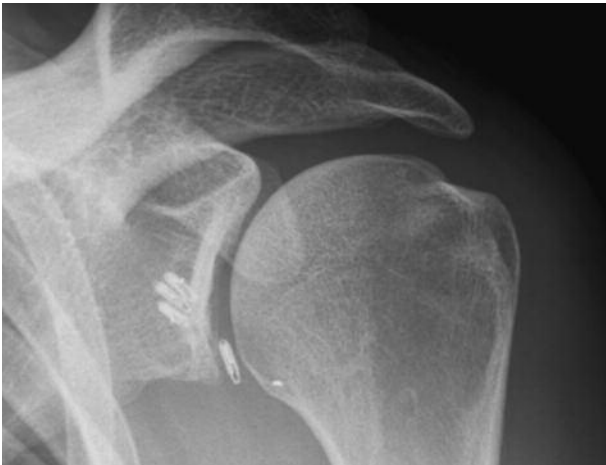
Fig. 1. — Antero-posterior radiograph of the left shoulder demonstrating one extra-osseous metal suture anchor.