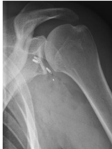
Fig. 3. — Antero-posterior radiograph of the left shoulder taken two days after the index surgery in 2002. One metal suture anchor is not within the glenoid bone.

The arthroscopy was performed under general anaesthesia, with the patient in the lateral decubitus