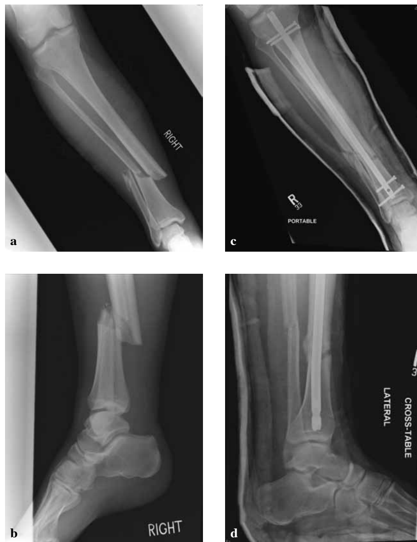
Fig. 2 — a : 43 year-old male sustained a closed tib-fib fracture from a crush injury, AP preoperative radiograph. b : AP postoperative radiograph. c : lateral preoperative radiograph. d : lateral postoperative radiograph.

Similarly, Wysocki et al (12) reported on the postoperative radiographic outcome of intramedullary nailing of proximal and distal one-third tibial shaft fractures using intraoperative two-pin external fixation, or “traveling traction.” The results of this study revealed 25 of the 27 patients with distal third tibia fractures to have acceptable alignment with 5° or less of angulation in every plane and less than 1 cm shortening. The authors concluded that traveling traction is a useful and effective tool in obtaining intraoperative reduction. However, the set up time