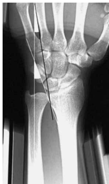
Fig. 1. — Radiological evaluation. Ulnar head inclination represents the angle between the longitudinal shaft of the ulna and the tangent to the ulnar head. Sigmoid notch inclination represents the angle between the longitudinal shaft of the ulna and the tangent to the sigmoid notch of the radius.