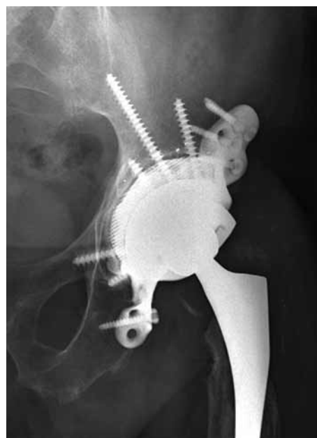
Fig. 2. — Two-year postoperative AP pelvic radiograph showing the well-fitted acetabular component and the restored centre of rotation of the hip.

The porous surface of the implant encourages bone ingrowth, thus promoting long-term implant stability by osseointegration. The larger space filling scaffold is constructed as an augment with a porous macrostructure. It is in continuity with the metal plate, forming an one-piece implant. The areas of the flanges contacting the host bone are also covered with porous metal as a structural