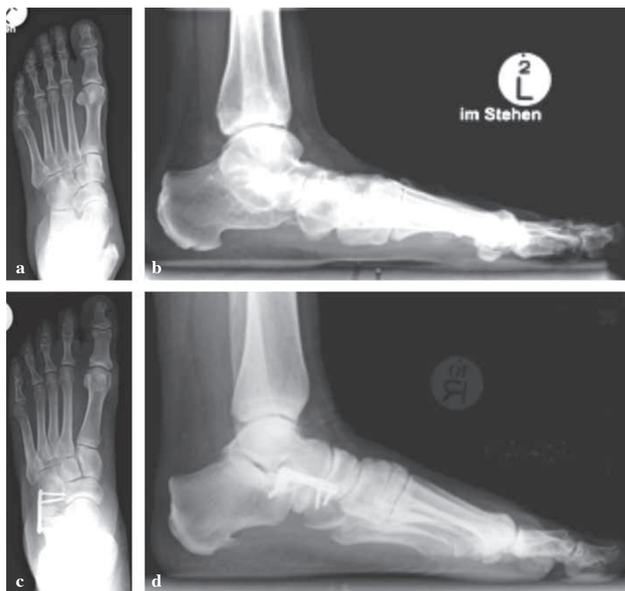
Fig. 1. — a,b) Dorsoplantar and lateral weight bearing radiographs show a pes planovalgus deformity ; c, d) Reconstruction of the pes planovalgus by calcaneocuboid distraction arthrodesis with allogenic bone grafting (one year postoperatively).

observed in 11 of 12 cases on average 10 weeks postoperatively.