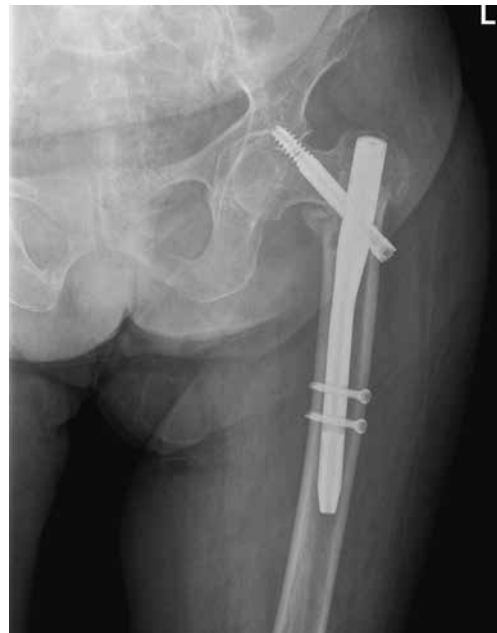
Fig. 3d. — An anteroposterior radiograph of the left hip demonstrating the cut-out of the neck screw at 5 weeks post-operatively.