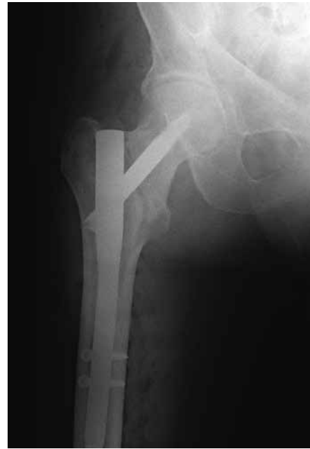
Fig. 4b. — Post-operative anteroposterior radiograph of the same patient treated with DLT nail.