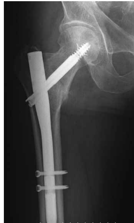
Fig. 4d. — Follow-up anteroposterior radiograph of the same patient's right hip at 3 months postoperatively demonstrating the united fracture with DLT nail.