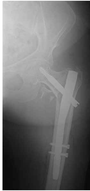
Fig. 3b. — Post-operative anteroposterior radiograph of the same patient treated with DLT nail.