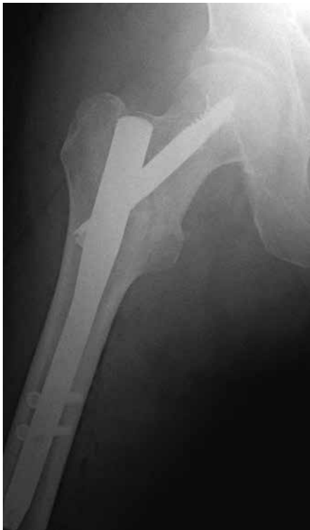
Fig. 4c. — Post-operative lateral radiograph of the same patient's right hip.