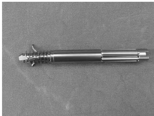
Fig. 1b. — The figure is demonstrating the wedge wings in the neck screw.

A single centre multi-surgeon retrospective study was conducted on 95 patients older than 60 years who underwent DLT nail (DLT™ Nail, U & I Corporation 529-1, Yonghyun-dong, Uijungbu Kyunggi-Do, Korea 480-050) (Figs. 1a-b) implantation for intertrochanteric fractures of the femur. Eight patients who died during the 1 st postoperative year due to medical complications were not evaluated. A total of 87 patients, 63 female (72.4%) and 24 male (27.6%) with a mean age of 77 years (range, 60-96 years) were available for the outcome analysis. The etiology of all the fractures was a simple fall. The fractures were classified according to the OTA/AO classification system as 31-A (19), and the patients were classified according to the fracture types as Group 1 (31-A1) and Group 2 (31-A2). Thus, 36 patients (41.4%) were classified as 31-A1 and 51 patients (58.6%) as 31-A2