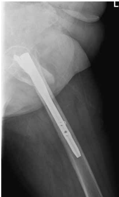
Fig. 3c. — Post-operative lateral radiograph of the left hip.