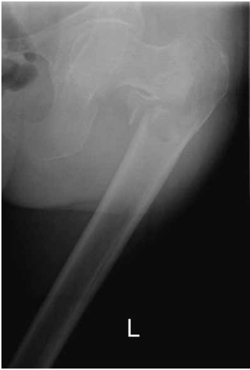
Fig. 3a. — Pre-operative anteroposterior radiograph of the left hip demonstrating 31-A2 intertrochanteric fracture in an 86-year-old woman.