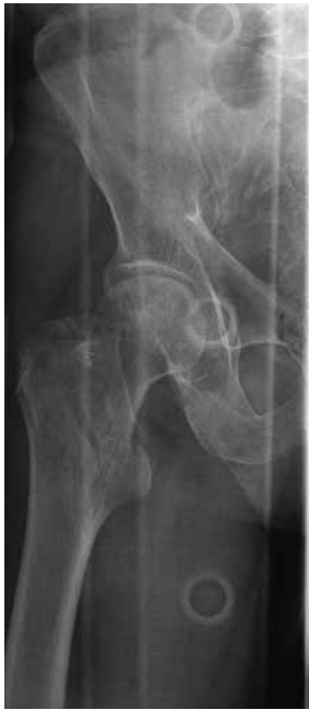
Fig. 4a. — Pre-operative anteroposterior radiograph of the right hip demonstrating 31-A1 intertrochanteric fracture in a 78-year-old man.