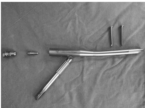
Fig. 1a. — The figure is demonstrating the Dyna Locking Trochanteric Nail, consists of intramedullary nail, neck screw, distal locking screws, fixed nail cap and end cap.

The Dyna Locking Trochanteric (DLT) nail (U & I Corporation 529-1, Yonghyun-dong, Uijungbu Kyunggi-Do, Korea 480-050) is a recent addition to the growing list of intramedullary implants. To the best of our knowledge, no published reports in English literature have systematically assessed the role of the newly developed DLT nail on the basis of a study on a relatively large series. The objective of this study was to evaluate the clinical and radiological outcomes of low velocity intertrochanteric fractures fixed by DLT nail in 31-A1 and A2 fractures with particular emphasis on our experience.