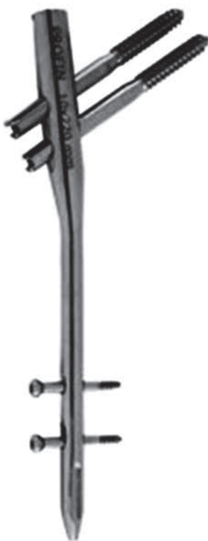
Fig. 2. — Proximal femoral nail (PROFIN)

diameter screws, one dynamic and one static, at the distal end (Fig. 2).