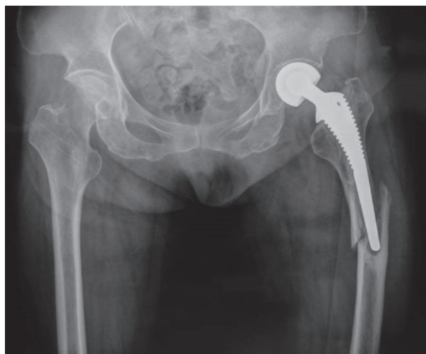
Fig. 3. — Anteroposterior radiograph of the pelvis showing a B3 type periprosthetic fracture. The stem is loose but there is deficient bone stock in the proximal femur.

The study was approved by IRB (Institutional Review Board) of the hospital. We retrospectively analyzed a cohort of 41 consecutive patients who had sustained a periprosthetic fracture of the hip between January 2000 and October 2014. Each subtype applied to the femur of the Unified Classification System was represented at least