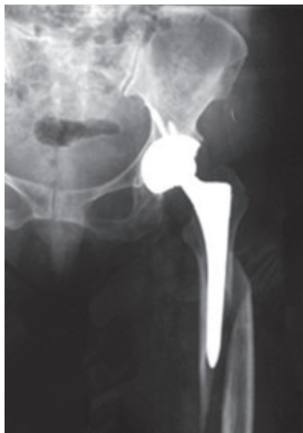
Fig. 1. — Anteroposterior radiograph of the left hip and proximal femur showing a B1 type periprosthetic fracture. The stem is well-fixed.

Type A fractures are located at the lesser trochanter (AL) and at the greater trochanter (AG). Type B fractures are located around or just below a well-fixed stem (B1) (Fig. 1), around or just below a loose stem with adequate bone stock (B2) (Fig. 2), around or just below a loose stem with poor proximal bone stock (B3) (Fig. 3). Type C fractures are significantly distal to the stem. Type D is a fracture of the femoral after hip and knee arthroplasty (Type C for each joint). Type E is both a fracture of the acetabulum and femur after hip arthroplasty (Fig. 4). Type F fracture pattern applies only to the acetabulum after hemi-arthroplasty of the hip.