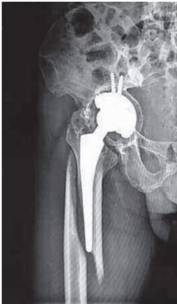
Fig. 4. — Anteroposterior radiograph of the right hip and proximal femur showing a type E periprosthetic fracture of the proximal femur with an associated fracture of the acetabulum.

All data were analyzed using the weighted Kappa statistic to measure the level of agreement for 2 observers, using the Landis and Koch (15) criteria for interpretation. Values of 0.00 to 0.20 indicate slight agreement ; 0.21 to 0.40, fair agreement ; 0.41 to 0.60, moderate agreement ; 0.61 to 0.80, substantial agreement. Values of more than 0.80 represent almost perfect agreement (15).