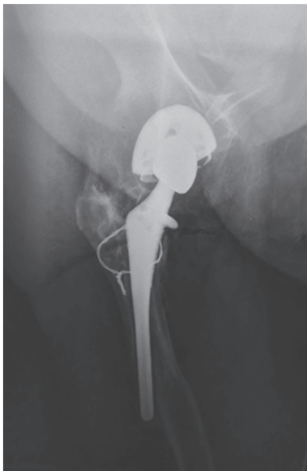
Fig. 2. — Lateral radiograph of the left hip and proximal femur showing a B2 type periprosthetic fracture. The stem is loose but there is adequate bone stock.

For any classification system to be useful, it should not only guide treatment and help in the decision-making process, but also be reliable and valid. The objective of this study is to independently assess the interobserver and intraobserver reliability and validity of the Unified Classification System, in our hospital.