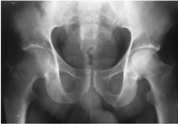
Fig. 1. — Anteroposterior xray of both hips in a 35-year-old male patient demonstrating severe osteopenia of the right femoral head and neck. This was the first episode of an RMO.