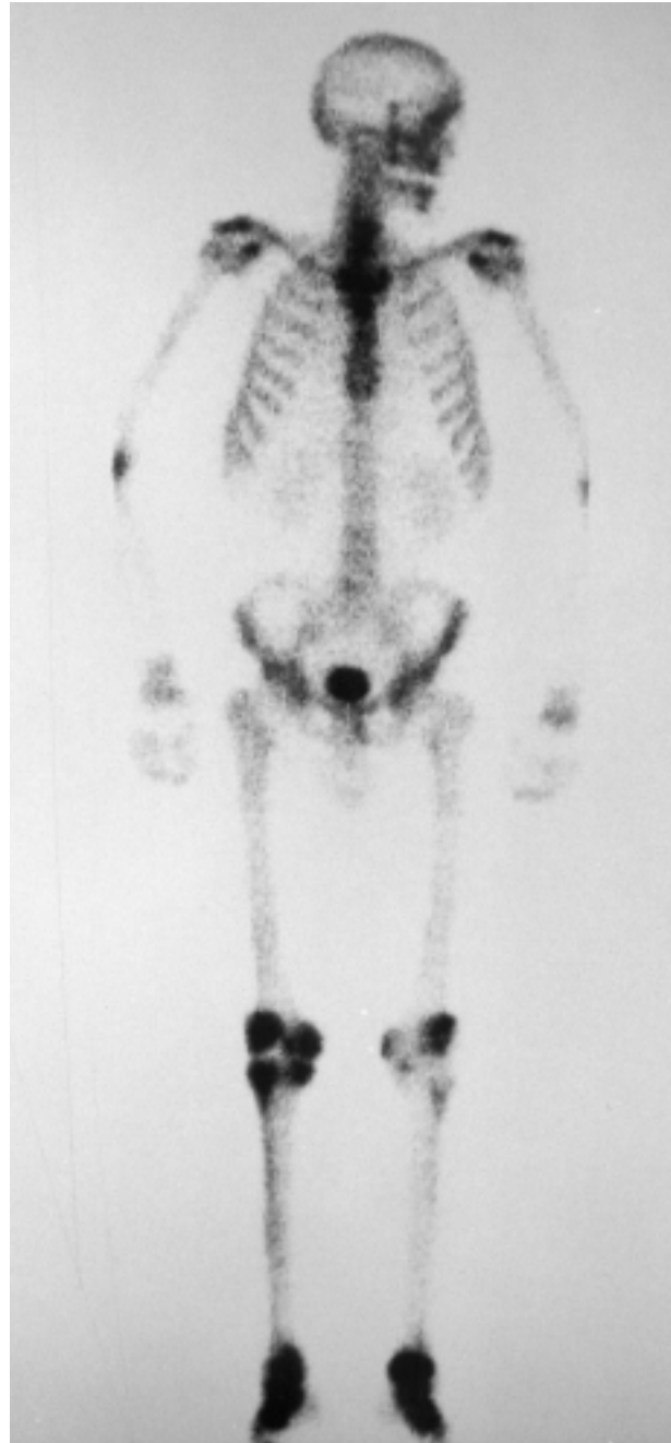
Fig. 4. — Radionuclide bone-scanning shows diffuse, homogeneous uptake of the isotope over the right knee and the feet (same patient as fig. 3).

Bloem in 1988 gave the first description of MRI changes observed in TO of the hip (6). They can be detected as soon as with bone scans (48 hours), and regression of the abnormalities can be seen along with symptom improvement, about 6 to 8 months later (12). An ill-defined area of decreased signal intensity is seen on T1-weighted images, with an area of increased signal intensity on T2-weighted images ; these diffuse signal abnormalities have been attributed to bone marrow edema (58). In addition, an effusion is usually present. In the hip, these changes mainly affect the head, neck and intertrochanteric region (fig. 2) (12, 22).