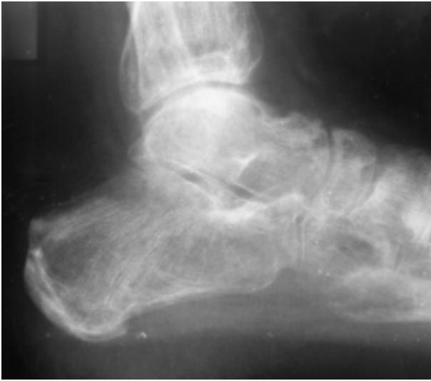
Fig. 3. — Osteopenia and cortical thinning of the ankle and foot. Articular spaces are preserved (same patient as figs. 1 and 2, in a subsequent episode of RMO).