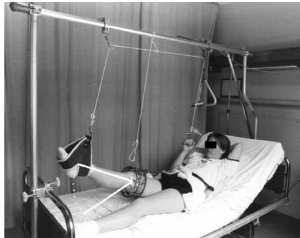
Fig. 1. — Pulley system that permits the patient to perform passive flexion and extension.

Preoperatively the patients were evaluated for muscle strength, knee ROM, sensibility, limb length discrepancy, joint stability and general function. Immediately after the operation, the patients were positioned in an adjusted hospital bed with a pulley system that permitted them to perform passive flexion and extension in order to stretch the quadriceps and hamstrings (fig 1). During the hospital stay, patients received standard physical therapy twice a day. In the latency period, the therapy started with iso-