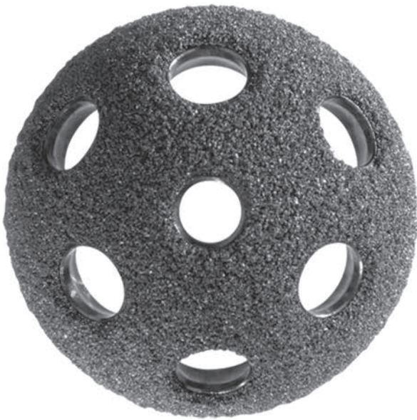
Fig. 1. — Gription Multihole Mega Cup

reamer used). Augmentation of the acetabular bony defects was achieved using cancellous autogenous iliac bone graft. Mincing of the graft was accomplished by reverse reaming, trailed by introduction of the Multi-hole mega Gription (Fig. 1) porous coated cups (Depuy J&J, USA) in the best position ; maintaining the inclination and anteversion angles.