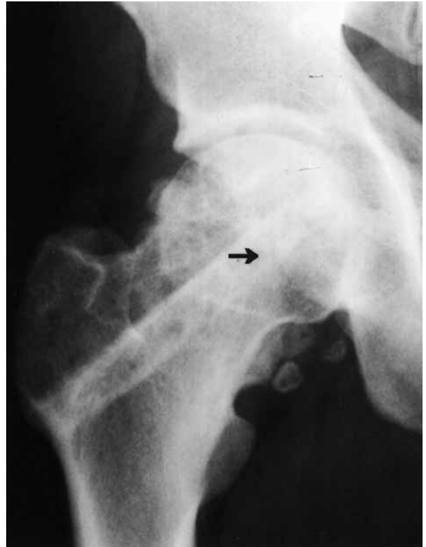
Fig. 1d. — Radiograph of hip (AP view) showing almost complete retention of the fibular graft outline 5 years post surgery, with good union and trabeculae crossing the fibular graft (arrow).

than half of the fibular graft remained visible were labeled as type III incorporation (fig 1c), and in 5 others, more than two-thirds of the original fibular graft was still recognisable (type IV incorporation) (fig 1d).