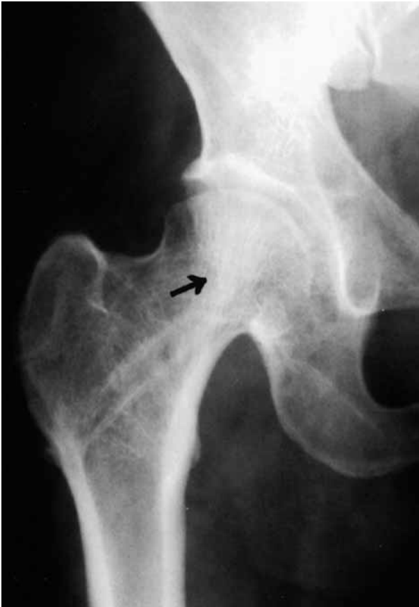
Fig. 1c. — Radiograph of hip (AP view) showing less than \frac{1}{2} incorporation of the fibular graft, but trabeculae are seen to cross the fibular graft as well as the fracture site.