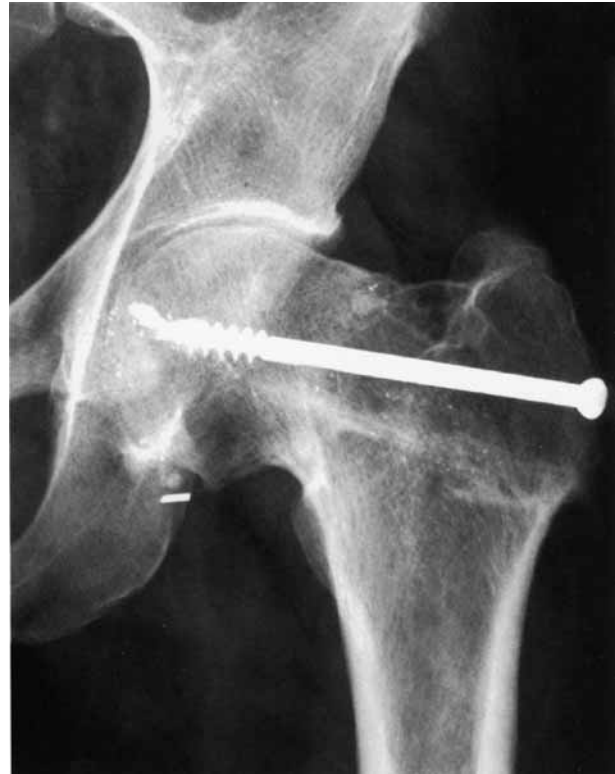
Fig. 1b. — Radiograph of hip (AP view) showing two-third incorporation of the fibular graft, and passage of host trabeculae across the cortical bone, 7 years post surgery.

radiological study. AP and lateral radiographs were assessed for the fate of the fibula inside the femoral neck ; a classification was devised by the authors to grade the extent of residual graft inside the cancellous bone of the femoral neck (table I), in an attempt to assess the rates of radiological incorporation. We also attempted to correlate the graft incorporation with time elapsed since surgery.