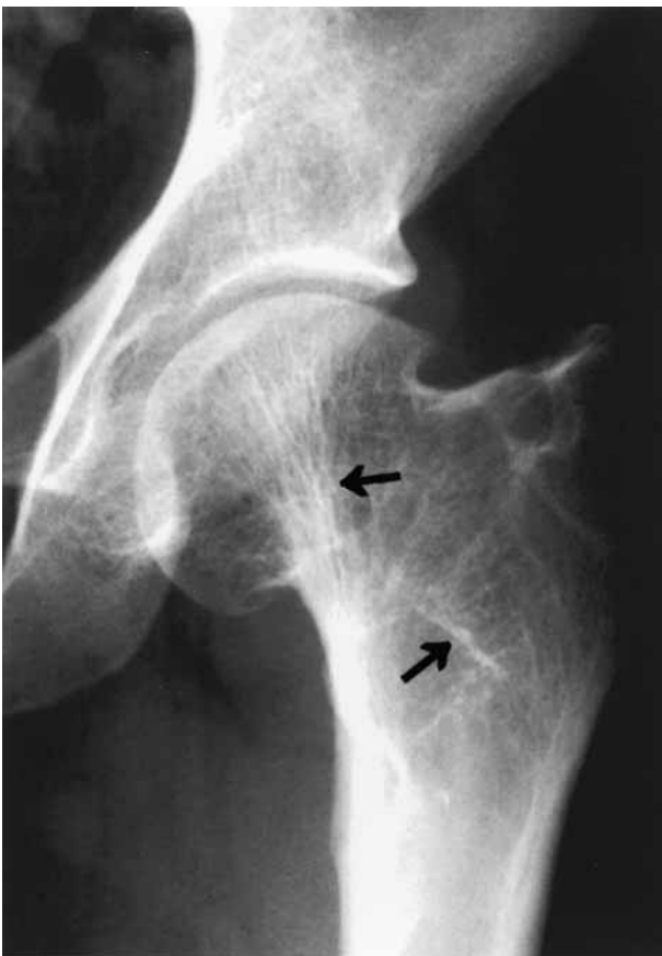
Fig. 1a. — Radiograph of hip (AP view) showing complete incorporation of the fibula, 17 years after fibular grafting. Note the revascularised femoral head and the (healed) subtrochanteric fracture which occurred 12 years post surgery.