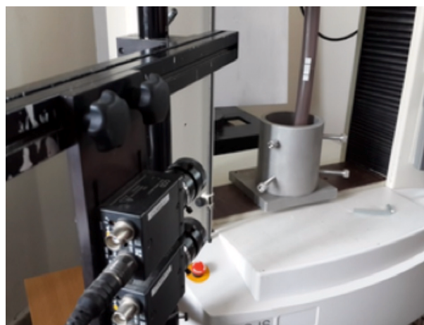
Fig. 3. — Video extensometer on the left side and optic markers on the composite femur in the universal test machine to measure the fracture site axial compression–distraction movement