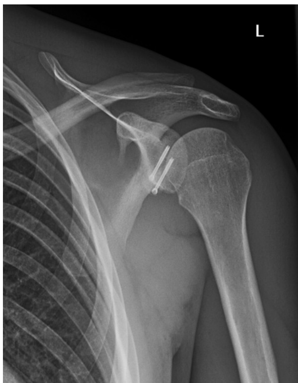
Figure 3. — An obvious bony spur at the base of the former coracoid process emphasizes pectoralis minor function.

This malunion however did not seem to cause any clinical impairment.