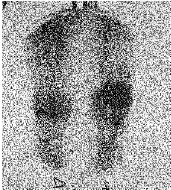
Fig. 2. — Gallium 67 bone scanning image. Intense focal uptake of the left knee can be observed.

bone were removed from the articular surfaces until bleeding was present, and new components were implanted immediately. As the patient was allergic to penicillin, a 6-week course of intravenous ciprofloxacin 750 mg every 12 hours was begun postoperatively; it was followed by intramuscular administration of the same antibiotic for 4 additional weeks.