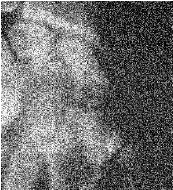
Fig. 2. — Case 2 typical X-ray finding.