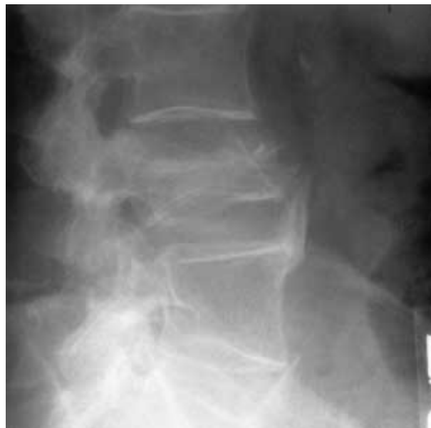
Fig. 2. — Lateral xray taken one month after xray in figure 1 showing progression of collapse.

cases of malignancy and intraosseous disc prolapse. The intravertebral vacuum cleft sign is probably not pathognomonic of Kummell's disease, but may be highly suggestive of it.