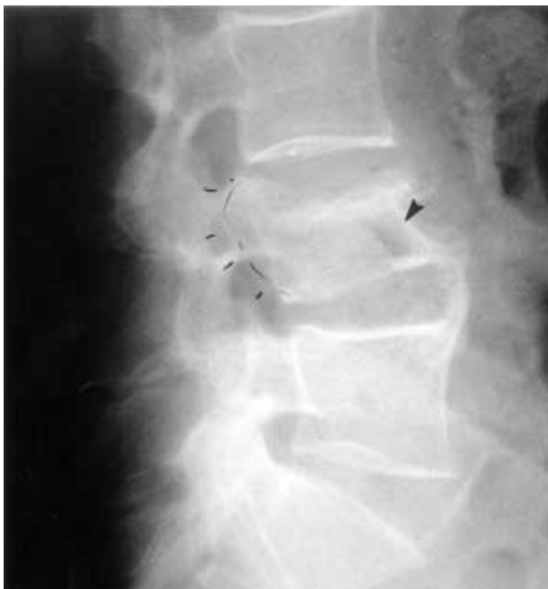
Fig. 1. — Lateral xray showing partial collapse of L4 vertebrae in a patient with Kummell's disease. See arrow pointing to intraosseous air.