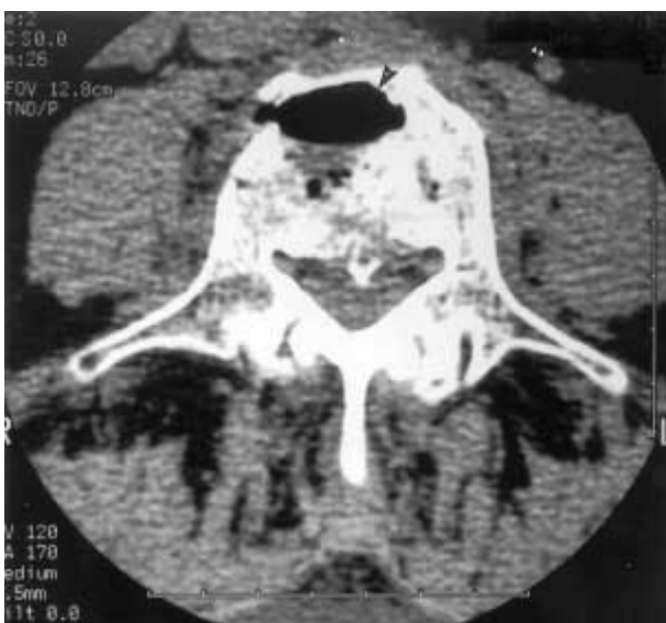
Fig. 3. — Axial CT scan of L4 vertebral body showing intraosseous air (see arrow).

cases of malignancy and intraosseous disc prolapse. The intravertebral vacuum cleft sign is probably not pathognomonic of Kummell's disease, but may be highly suggestive of it.