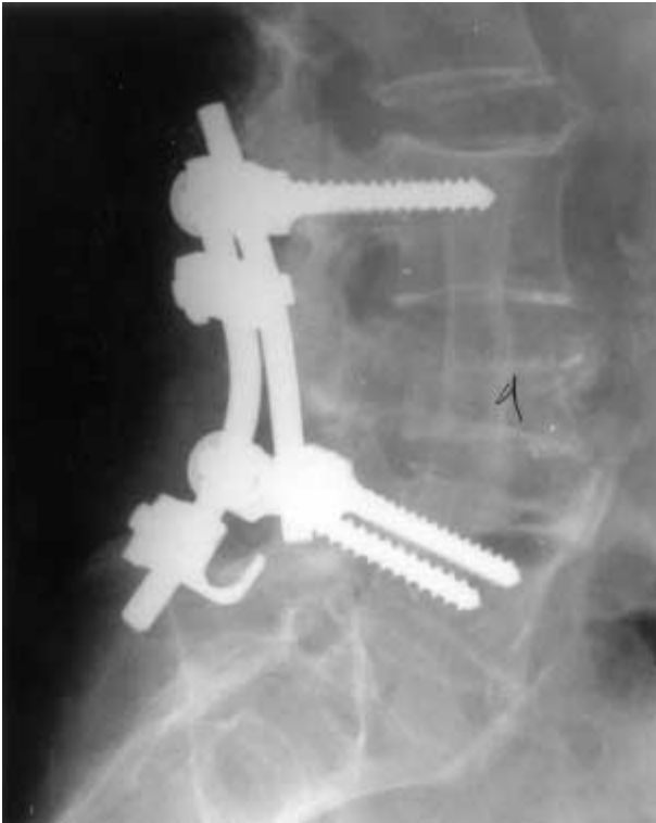
Fig. 6. — Postoperative lateral xray of same patient with Kummels'disease of the L4 vertebral body. Patient underwent an anterior corpectomy with placement of a bone graft followed by posterior instrumentation.